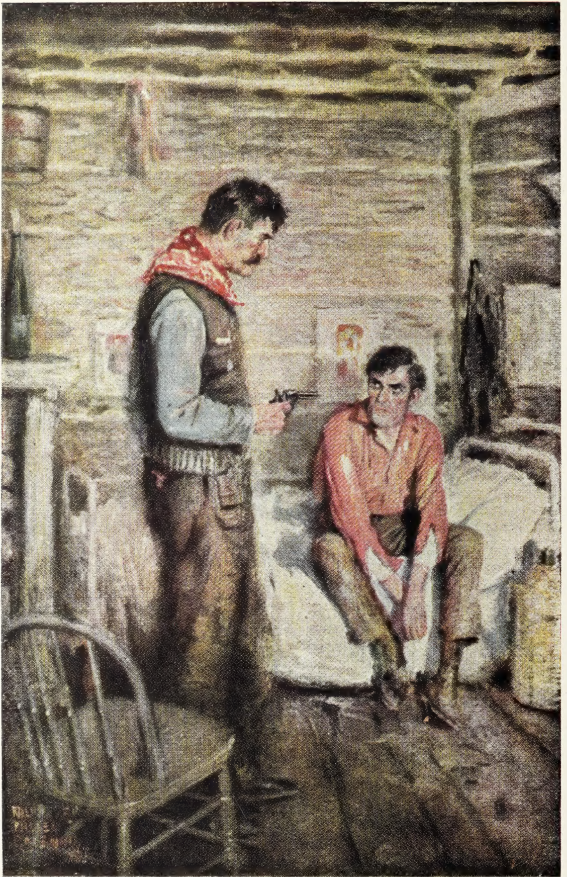
“His blazing black eyes stared into the gaze of Ross”